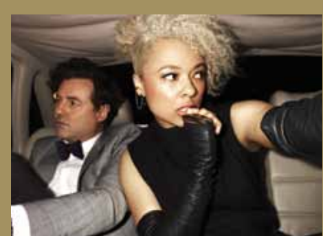
Sneaky Sound System