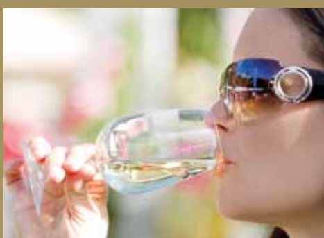
Superb wines from 60 top wineries