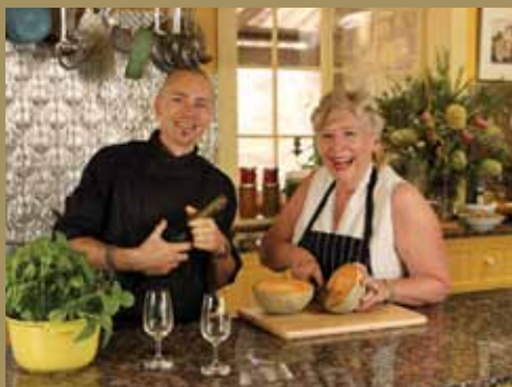
The Cook, The Chef & The Orchestra