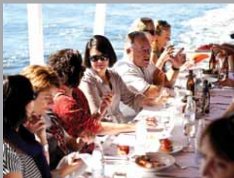
Gourmet Food Trails & Picnics