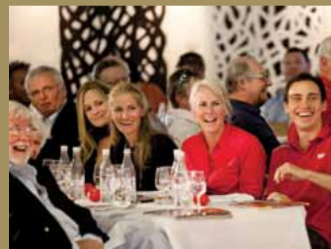
Fun hosted lunches & dinners